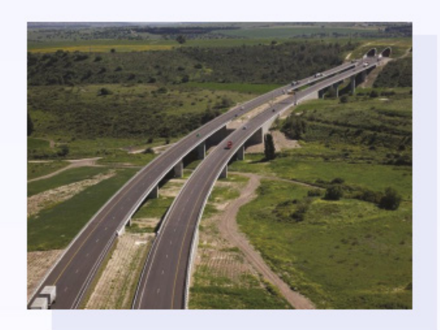
Highway 6 Clal is the largest shareholder in and supplies the bulk of the funds for the Cross-Israel toll highway- Highway 6